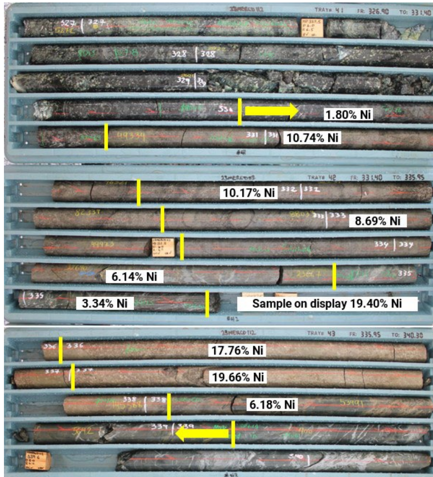
Figure 1 23MERC112 Individual assay results from disseminated to massive sulphide mineralisation.

23MERC112 9.14m @ 10.44% Ni, 0.75% Cu, 0.13% Co, 1.93g/t 3PGE from 330.00m Incl 2.61m @ 18.88% Ni, 0.48% Cu, 0.23% Co, 0.65g/t 3PGE from 335.44m