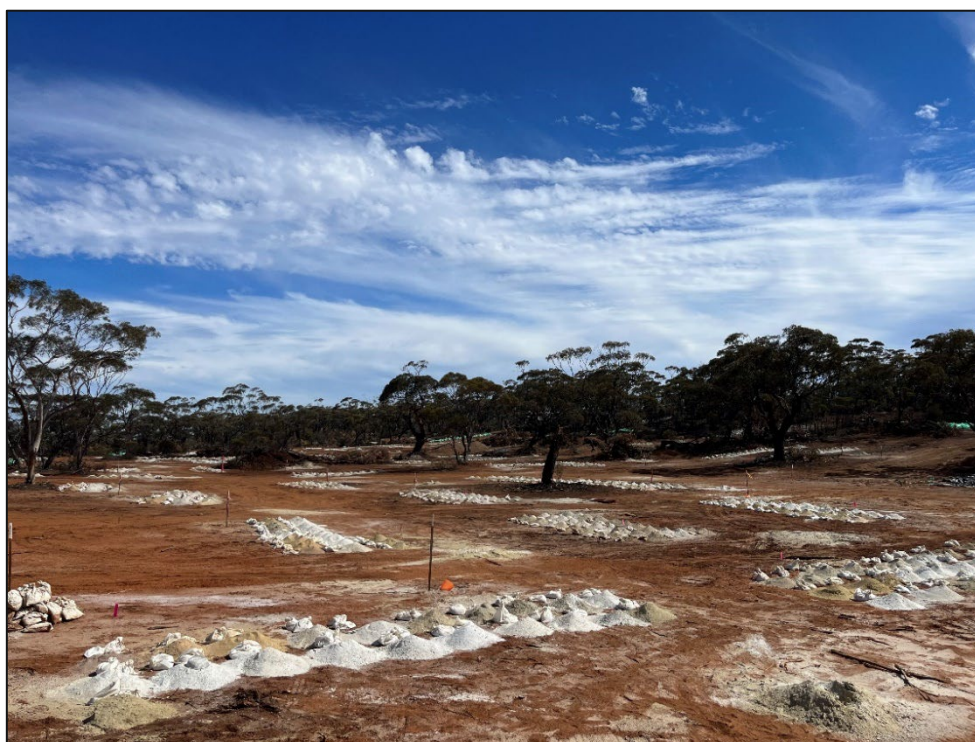
Figure 1 - Drilling at Faraday (white sample piles represent the pegmatite host)

The region is well endowed with lithium occurrences and includes three major resources at Dome North (Essential Metals Limited (ASX:ESS) to the south, Bald Hill (Lithco) to the east and Mt Marion (Mineral Resources Limited (ASX:MIN))/Gangfeng JV) to the north ( Figure 2 ).